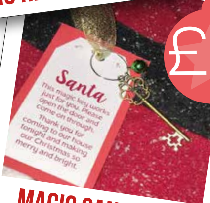
MAGIC SANTA KEY