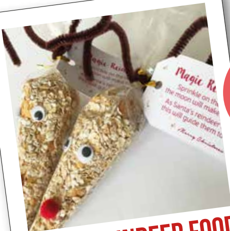
MAGIC REINDEER FOOD

NEXT WEEK WE LAUNCH OUR CHRISTMAS FUNDRAISING CAMPAIGN WITHIN NURSERY WHEN WE WILL BE SELLING: